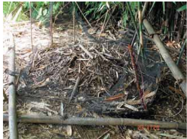
Figure 1. Philippine crocodile nest. The USM Wild Crocodile Research Team had placed a net around the nest to protect it from predators.

The following day the team visited the northern tributaries of Liguasan Marsh by motorized boat. A 2.5 m adult Philippine crocodile was observed basking along the bank of Moleta River at around 2 pm. Near Omonay village the team saw a Philippine crocodile nest of which 10 eggs had hatched the previous week (15 October 2007)(Fig. 1), suggesting differences in breeding ecology between the Luzon and Mindanao Philippine crocodile populations. In Luzon, C. mindorensis nests hatch in July. Six hatchlings from this nest are currently kept in captivity at USM, and the remaining four hatchlings are in the Moleta River. At night, a spotlight survey was conducted to practise survey techniques with the USM team; one adult C. mindorensis was observed, possibly the same individual that was seen during the day.