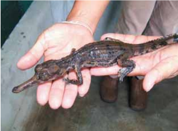
Figure 1. Tomistoma schlegelii hatchling at Utairatch Crocodile Farm.

We hope that any who are able, will consider participating in this workshop.