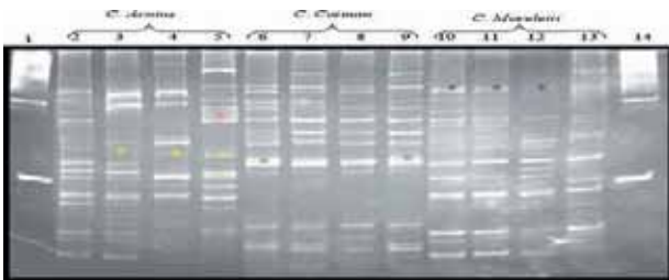
Figure 1. Polyacrylamide gel (8%): Lanes 1 and 14 indicate a marker with molecular weight of 100 base pairs; Lanes 2 to 5 C. acutus ; Lanes 6 to 9 C. crocodilus ; and, Lanes 10 to 13 C. moreletii .

Results and Discussion: With the E33 and T33 combination, 32 different fragments were obtained: 5 were specific to particular species, (2 C. acutus , 2 C. crocodilus , 1 C. moreletii ), 19 fragments were shared by two species (ie C. moreletii/C. acutus , C. crocodilus/C. moreletii , C. acutus/C. crocodilus ) and 8 were common to the three species (Fig. 1).