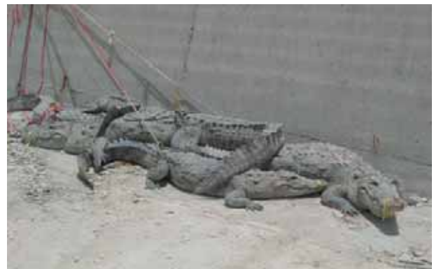
Figure 1. Mugger crocodiles captured in the overflow pool of Pishin Dam.

It took long time to capture all of the crocodiles, which appears to have caused considerable stress. Unfortunately, three crocodiles died (270, 225 and 185 cm TL) before they could be released into the Pishin Dam. Injuries were evident on the bodies of all crocodiles, indicating that they had attacked each other during their time in the pool which was decreasing in size and food availability daily.