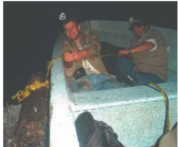
Figure 1. El Viejo being towed back to shore.

The crocodile soon tired, and another rope was placed around the base of its tail, before we headed to Bahía Caimán, about 1.5 km away. Progress against the flowing water, with the crocodile in tow (Fig. 1), required the full power of the 80 hp engine, and water constantly entered the 15 ft (4.6 m) fibreglass boat. At Bahía Caimán the four members of the team pulled the crocodile, estimated to weigh more than 300 kg, onto the shore, where his jaws were finally secured (Fig. 2).