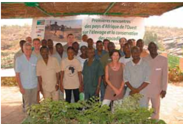
Figure 1. Participants of the first West African sub-regional meeting, Tapoa, Niger.

The meeting was considered a great success. Participants left with many new questions and ideas in the areas of crocodilian management and conservation in the region, which will hopefully generate much discussion and interest within the newly formed network.